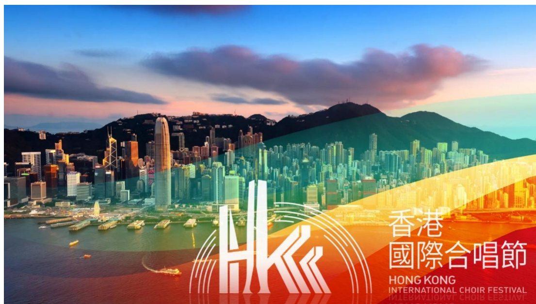
Schedule of Performing Teams for the First Hong Kong International Choral Festival